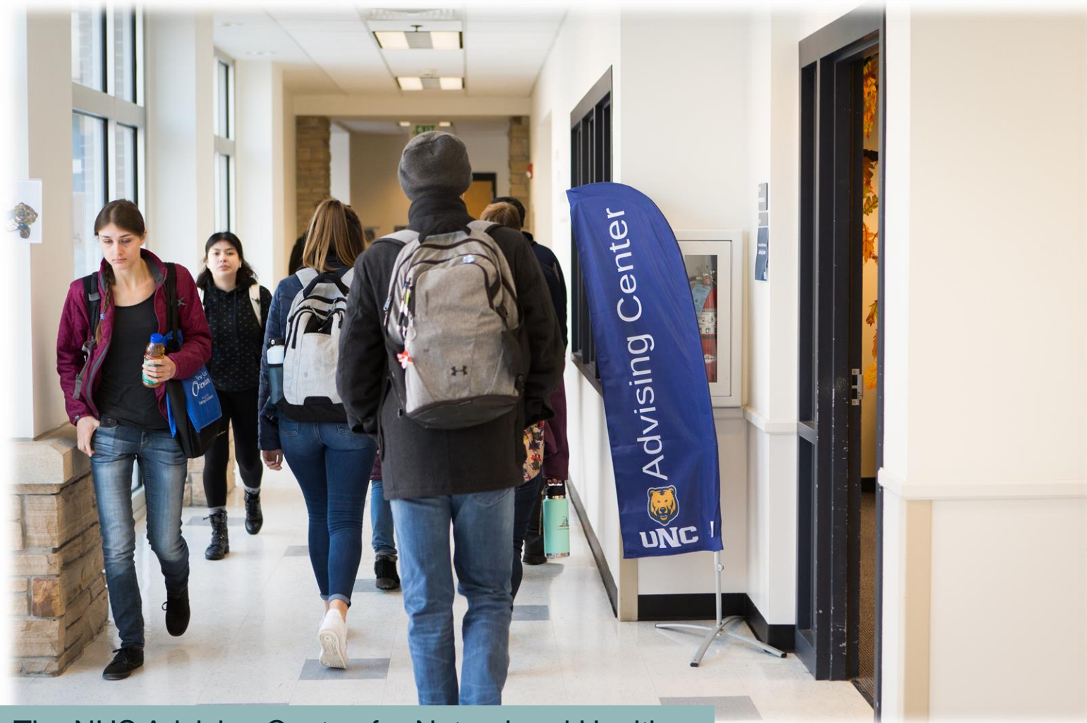
The NHS Advising Center, for Natural and Health Science majors is in Ross Hall.