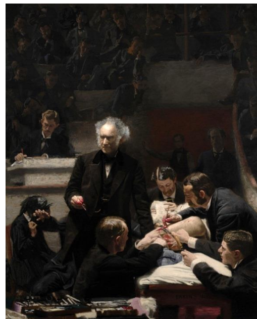
Thomas Eakins' "The Gross Clinic," 1875

WWU Mission: An independent voice in higher education, William Woods University distinguishes itself as a student-centered and professions-oriented university committed to the values of ethics, self-liberation, and lifelong education of students in the world community.