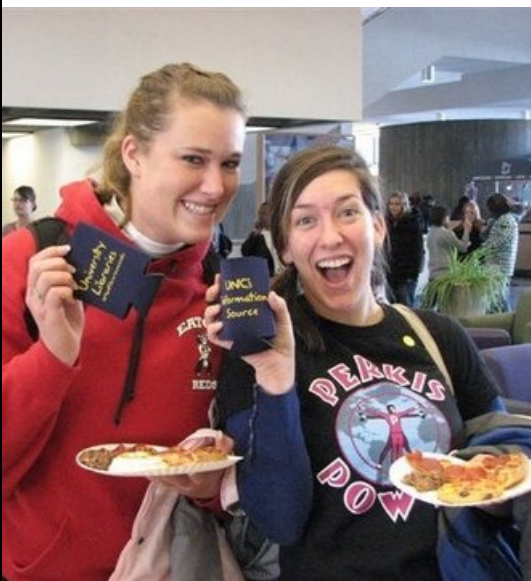
These students are delighted with pizza and drink koozies, as well as the break that follows finals week!

University Libraries held its bi-annual Pizza Lunch for students on Wednesday, December 9th. Students studying in the Michener Library were treated to Blackjack Pizza, desserts, and soda. The first 50 students received a new library koozie!