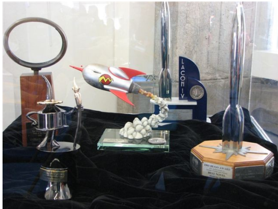
A selection of awards bestowed upon Connie Willis were on display during the February event.

astonishing ten Hugo Awards, six Nebula Awards and three Locus Awards, and she was recently inducted into the Science Fiction Hall of Fame.