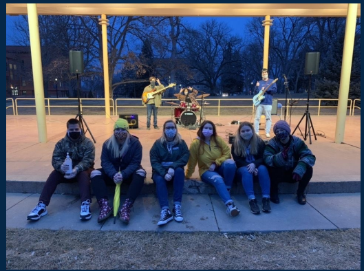
SHC officers with the Cowards - Spring concert