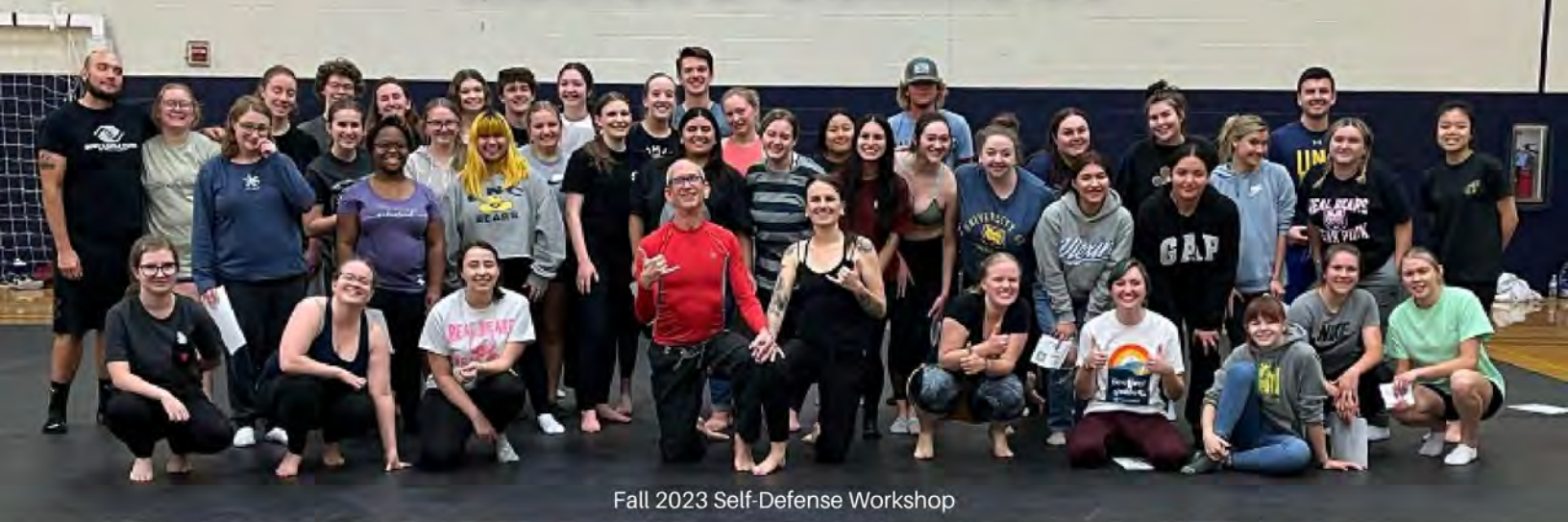
Fall 2023 Self-Defense Workshop