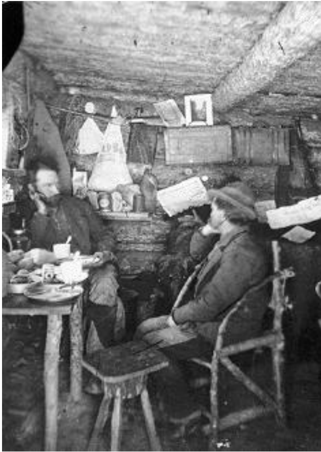
Two Miners in a Log Cabin

Two miners are sitting at their dining table in this photo. The table, chairs, and stool are homemade.