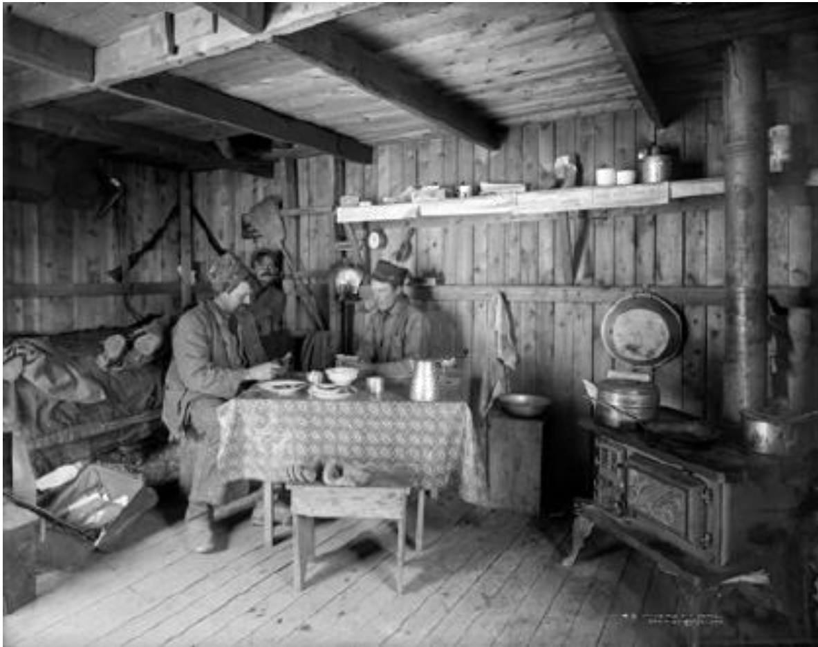
Three Miners in a Cabin

The men in this miners cabin are wearing work clothes and leather work boots.