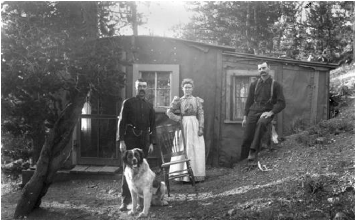
Miners Near Altman

This photo shows three people standing in front of a mining cabin in the mountains of Colorado. It was taken near the mining town of Altman, Colorado in 1889.