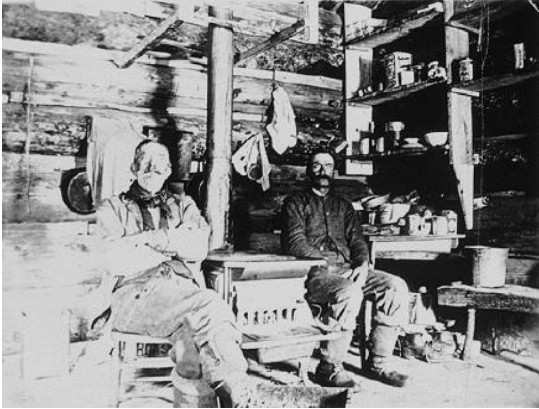
Two Miners Sitting in a Cabin