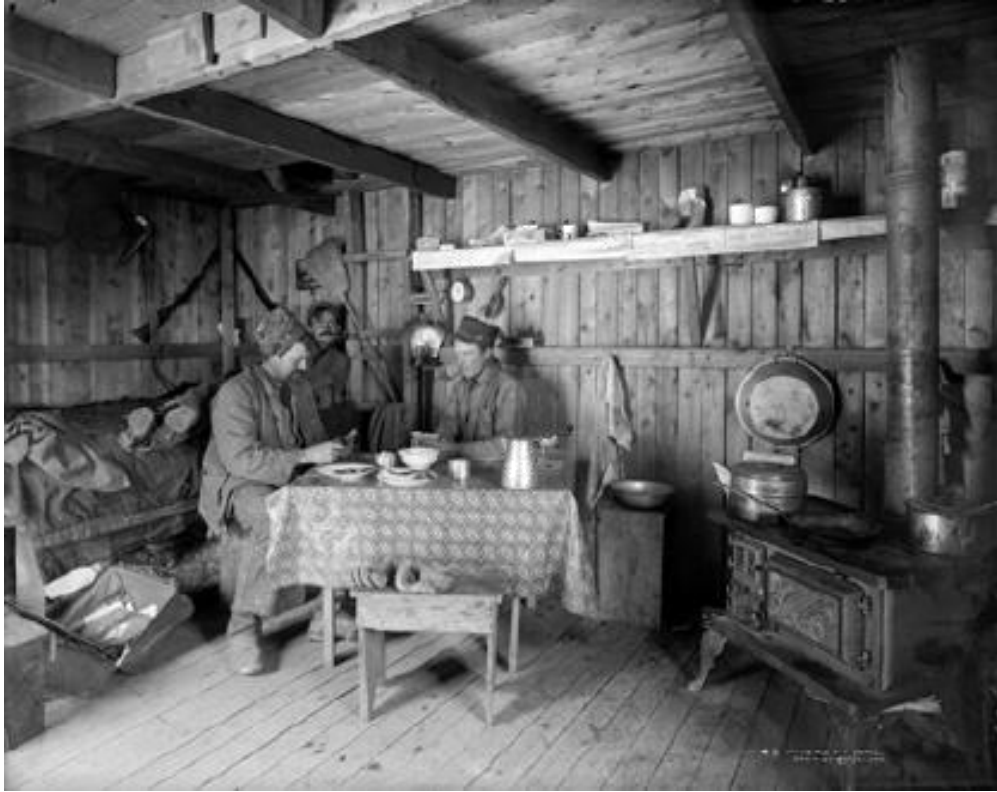
Miners playing cards in a Cabin