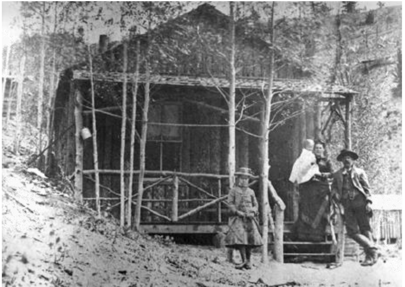
Mine Manager's Family