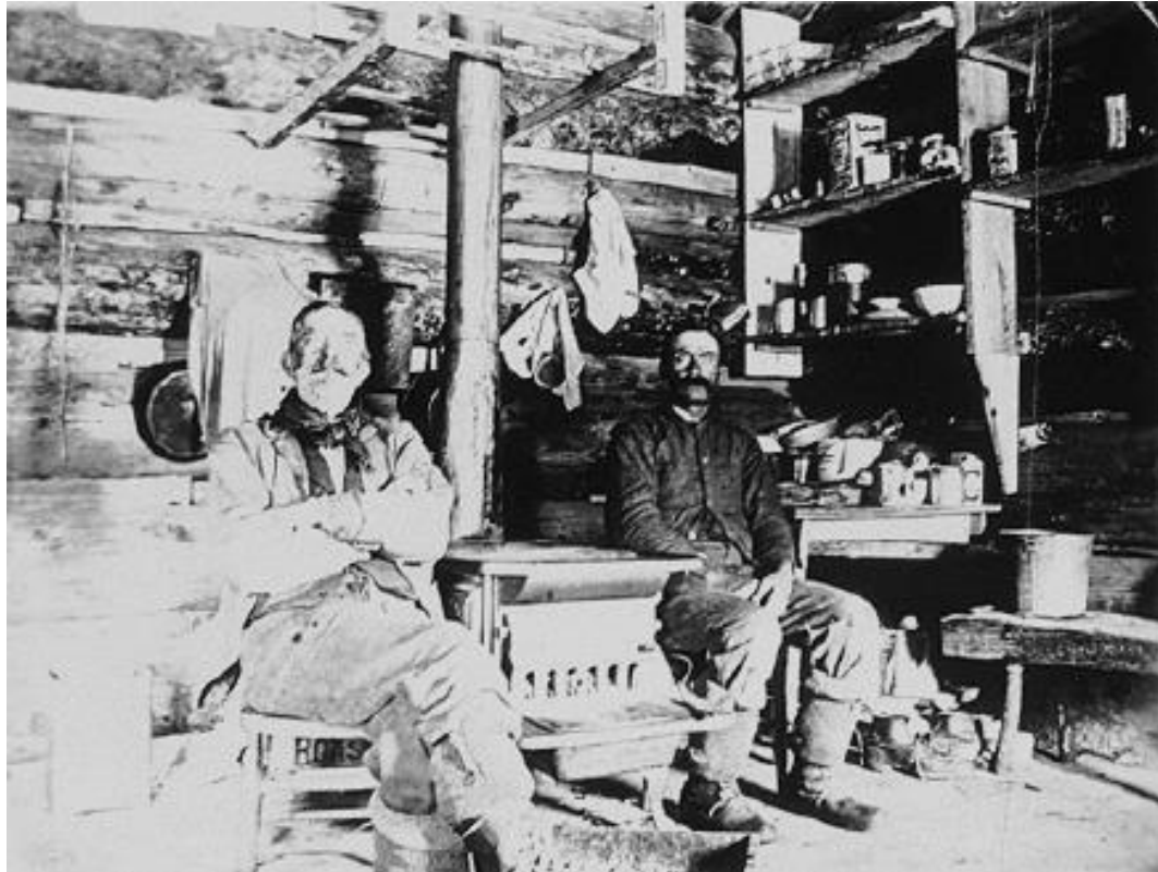
Two Miner by their Stove

This photo shows two miners sitting next to a stove in a log cabin. Their cabin had shelves for storing food. The men hung their skillets on the wall behind the stove.