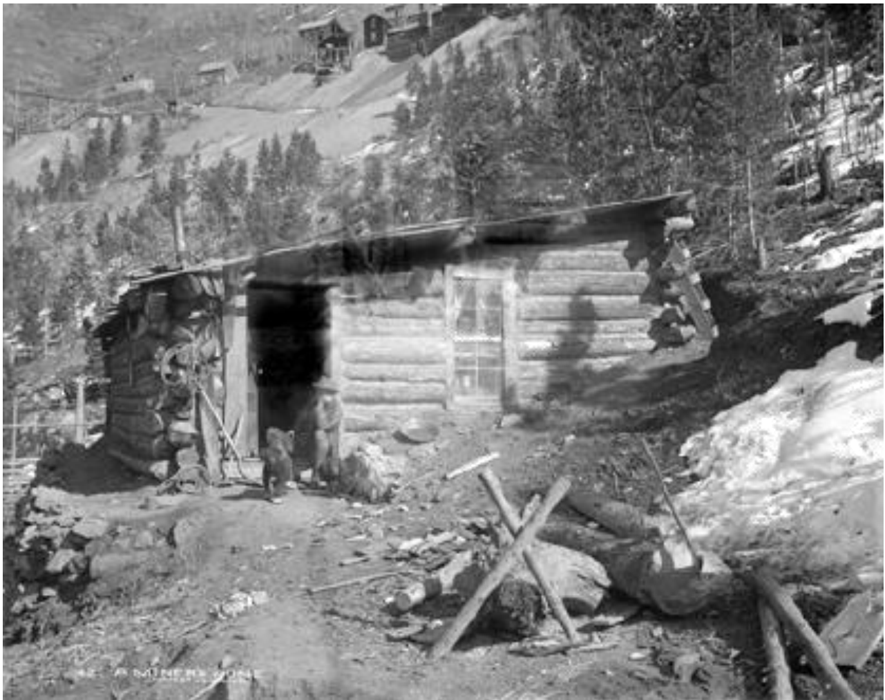
Miners Log Cabin

This is a one-room, miner's cabin somewhere in the mountains of Colorado. The cabin was built of logs.