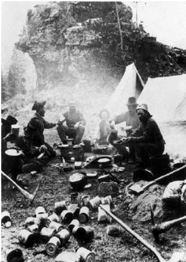
Miners in Camp

This was a miners' camp in the mountains of Colorado. The men are eating a meal. Their campsite is littered with empty food cans.