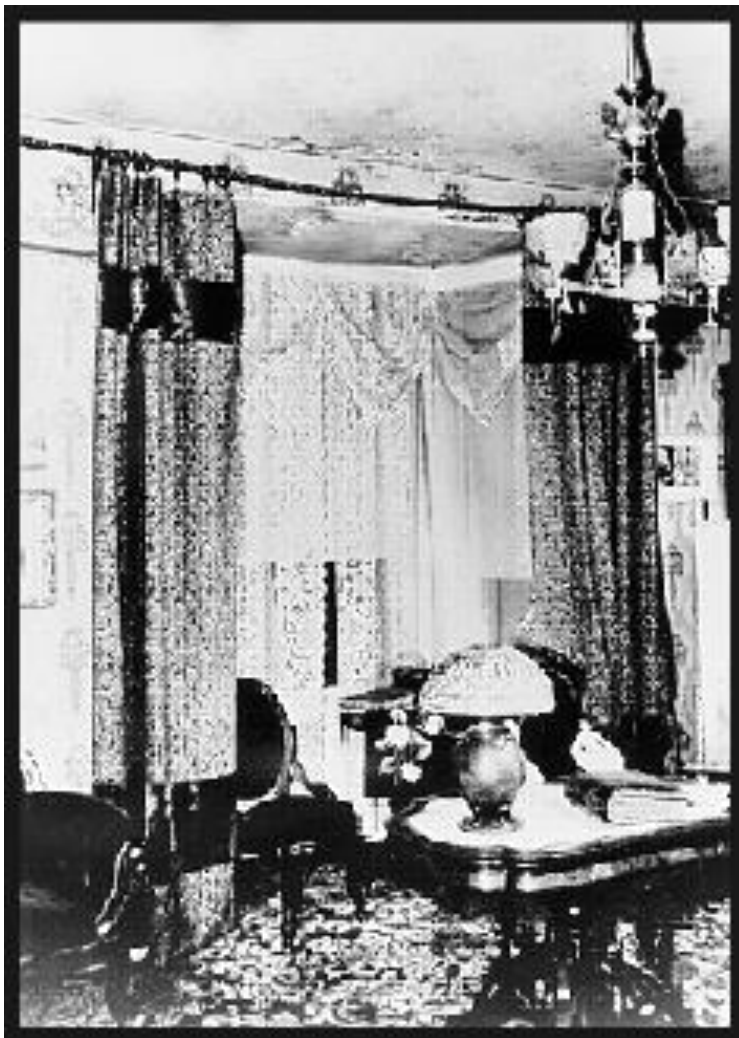
Inside the Healy House

This is a room in the Healy house in Leadville. It was furnished with drapes, carpets on the floor, and fine furniture.