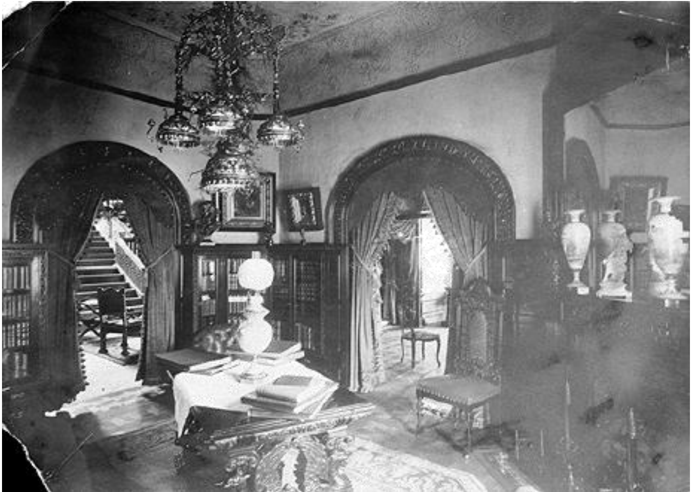
Inside an Expensive House

This is the library or reading room in a house in Leadville. It is furnished with bookcases, chairs and a table. The fireplace is decorated with vases and a sculpture.