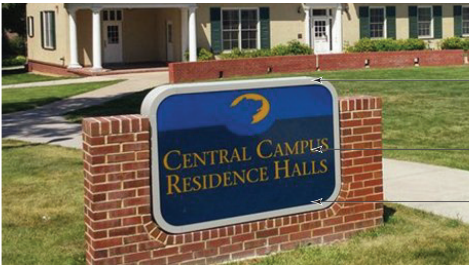
3 Sign Type Z: Exterior Monument Sign - Inset Photo 27.1 Scale: NTS