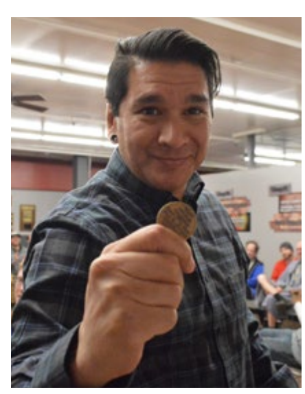
Step Denver | www.stepdenver.org