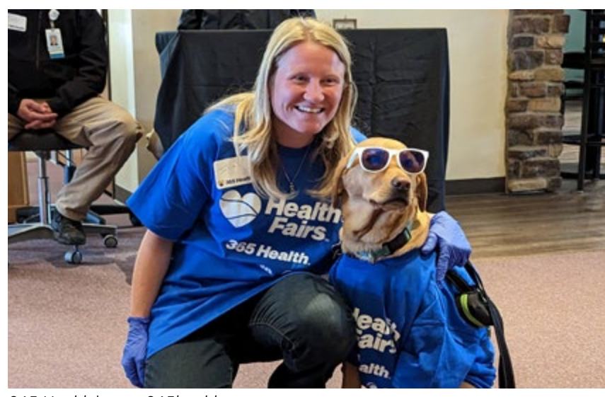
365 Health | www.365health.org