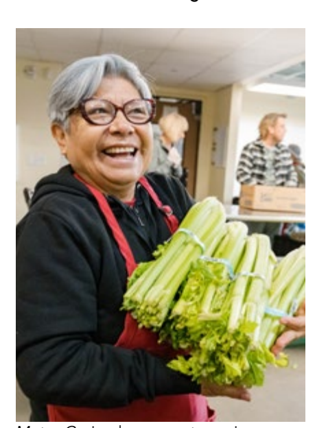
Metro Caring | www.metrocaring.org

www.FocusOnTheFamily.com Statewide Service Region