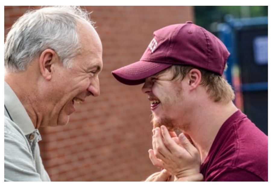
Developmental Disabilities Resource Center | www.ddrcco.org

www.friendsofctbl.org Statewide Service Region