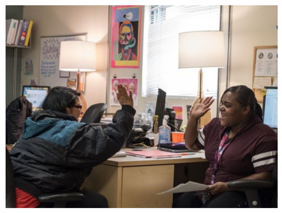
Urban Peak Denver | www.urbanpeak.org

www.younginvincibles.org Denver Metro Service Region