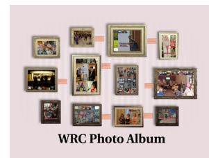
WRC Photo Album

The Women's Resource Center is proud to announce that the long awaited photo gallery on our website is officially available!