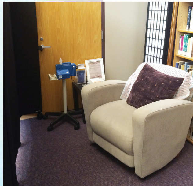
Center for Women's and Gender Equity Lactation Station

The Colorado Workplace Accommodations for Nursing Mothers (2008) law requires employers to provide adequate break time for an employee to express breast milk for their nursing child for up to two years after the child's birth. It also requires an employer to provide a private place for employees to express breast milk, other than a bathroom stall.