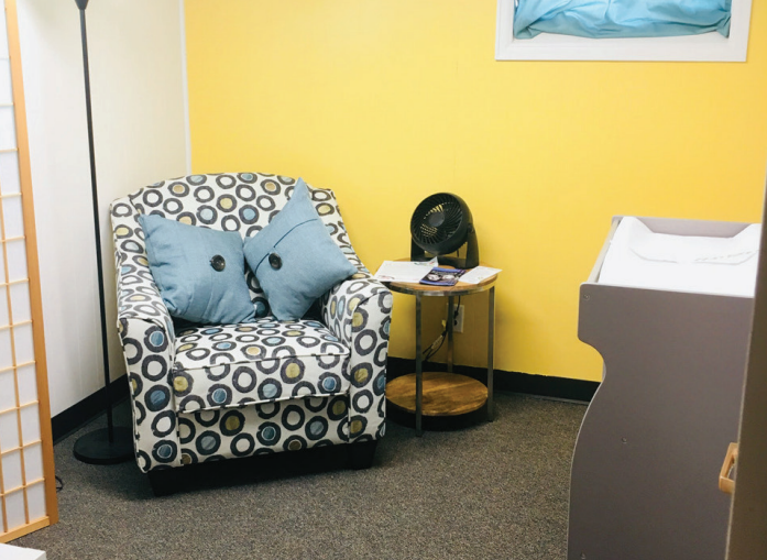
Gender and Sexuality Resource Center Lactation Station