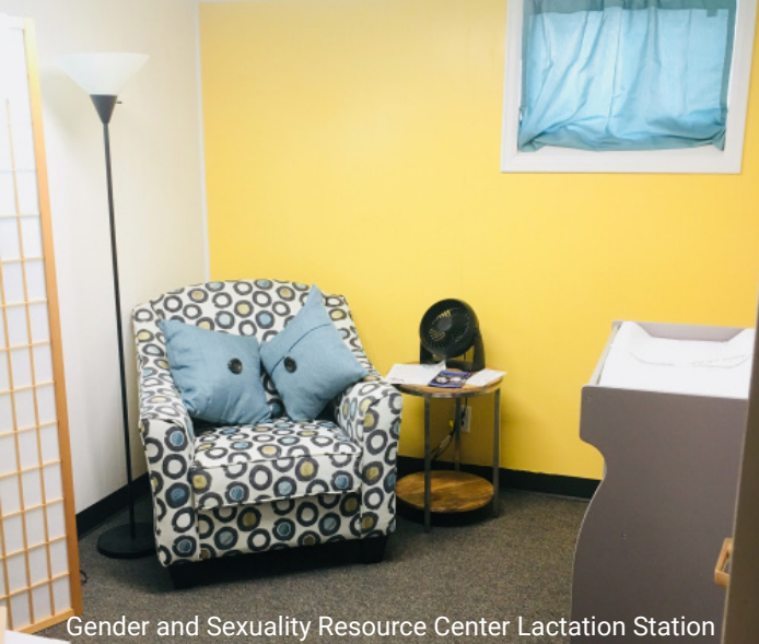
Gender and Sexuality Resource Center Lactation Station