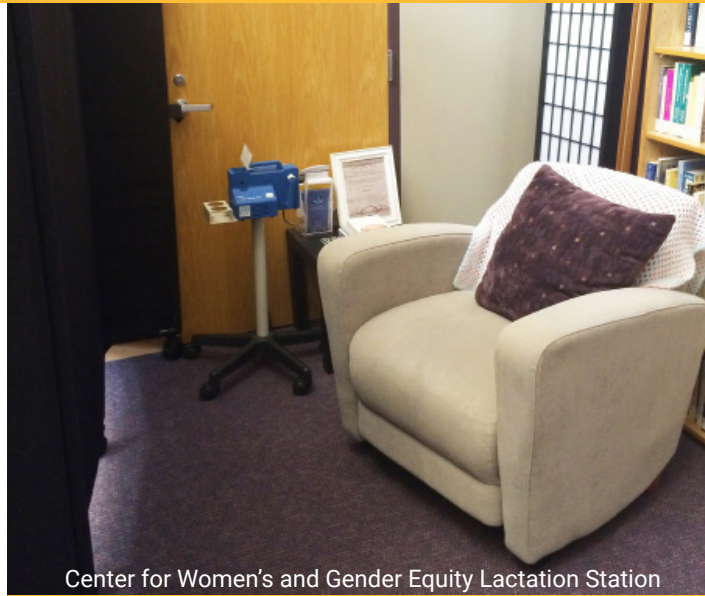
Center for Women's and Gender Equity Lactation Station

La Leche League of Colorado and Wyoming LLLcoloradowyoming.org