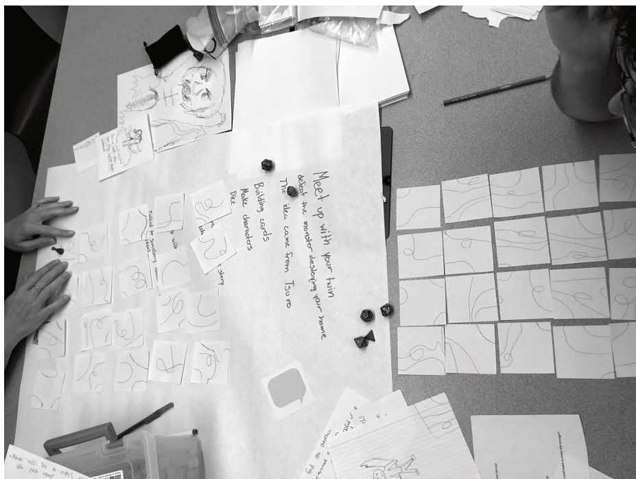
Figure 2. Chicken Nuggets prototyping Rotate .

If a player gets to the center (the opposite end of their tile game board), the monster attacks. That player then rolls the monster die (a d6 die) and subtracts that from his/her/their life points. The players then attack with a d6.