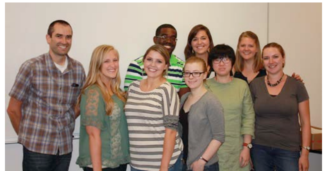
Fall 2015 Entering Cohort with Training Director

Fun fact: I'm an adrenaline junkie. I'm a river guide and love downhill mountain biking.