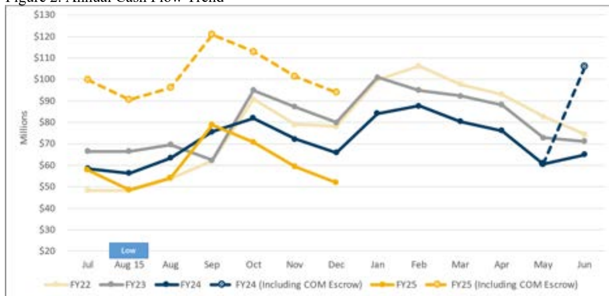
Figure 2. Annual Cash Flow Trend

The increase in cash in October 2021 (FY22) is noteworthy as the month in which approximately $17 million in HEERF II and III grants were received, in addition to the typical increase related to the receipt of payments for student charges at the beginning of the fall term.