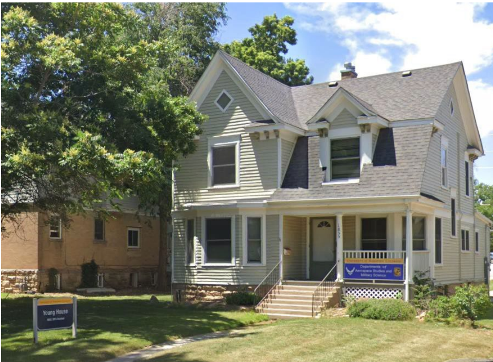
Subject Property

Through efforts to maximize space utilization, an additional single-family home at 1855 10 th Avenue has been identified as surplus. Staff is seeking the approval to sell this home through a competitive process. Weld County’s assessed value of the home is $328k.