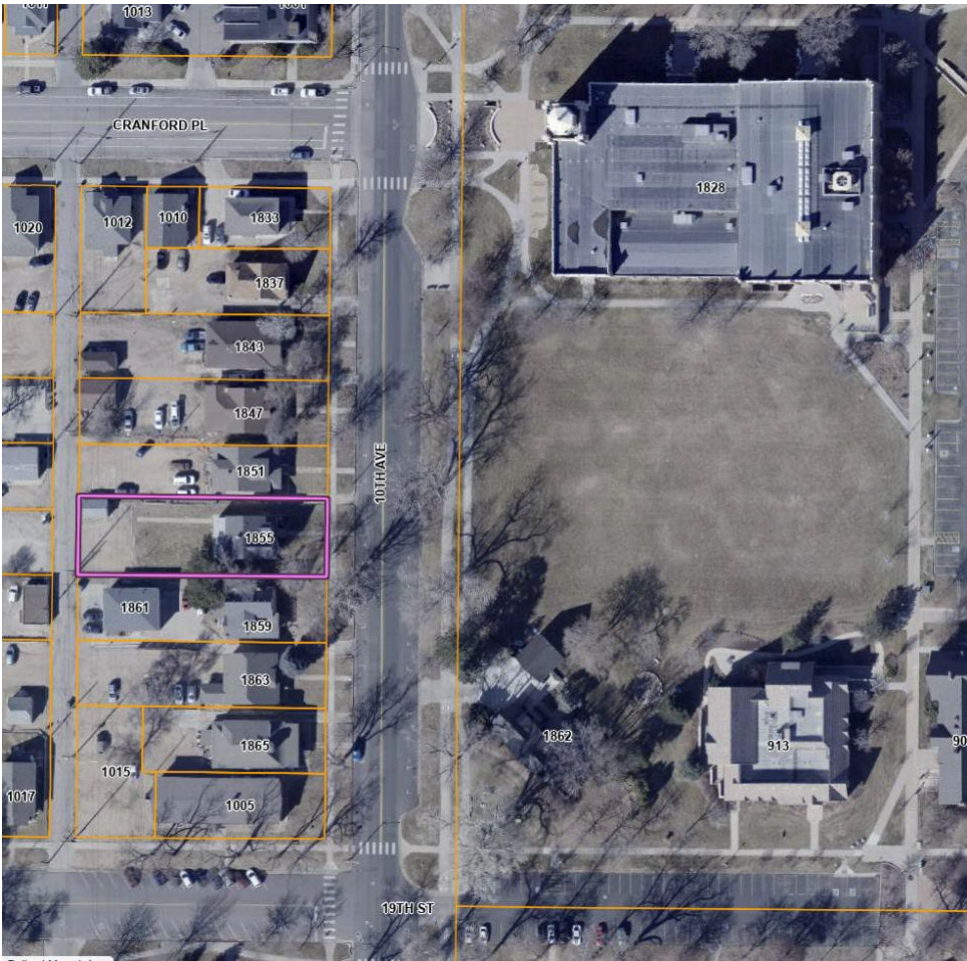
Subject Property