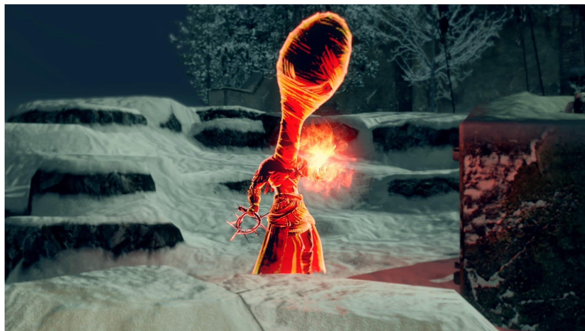
The "Cowardly" King Jeremiah as a Dark Spirit