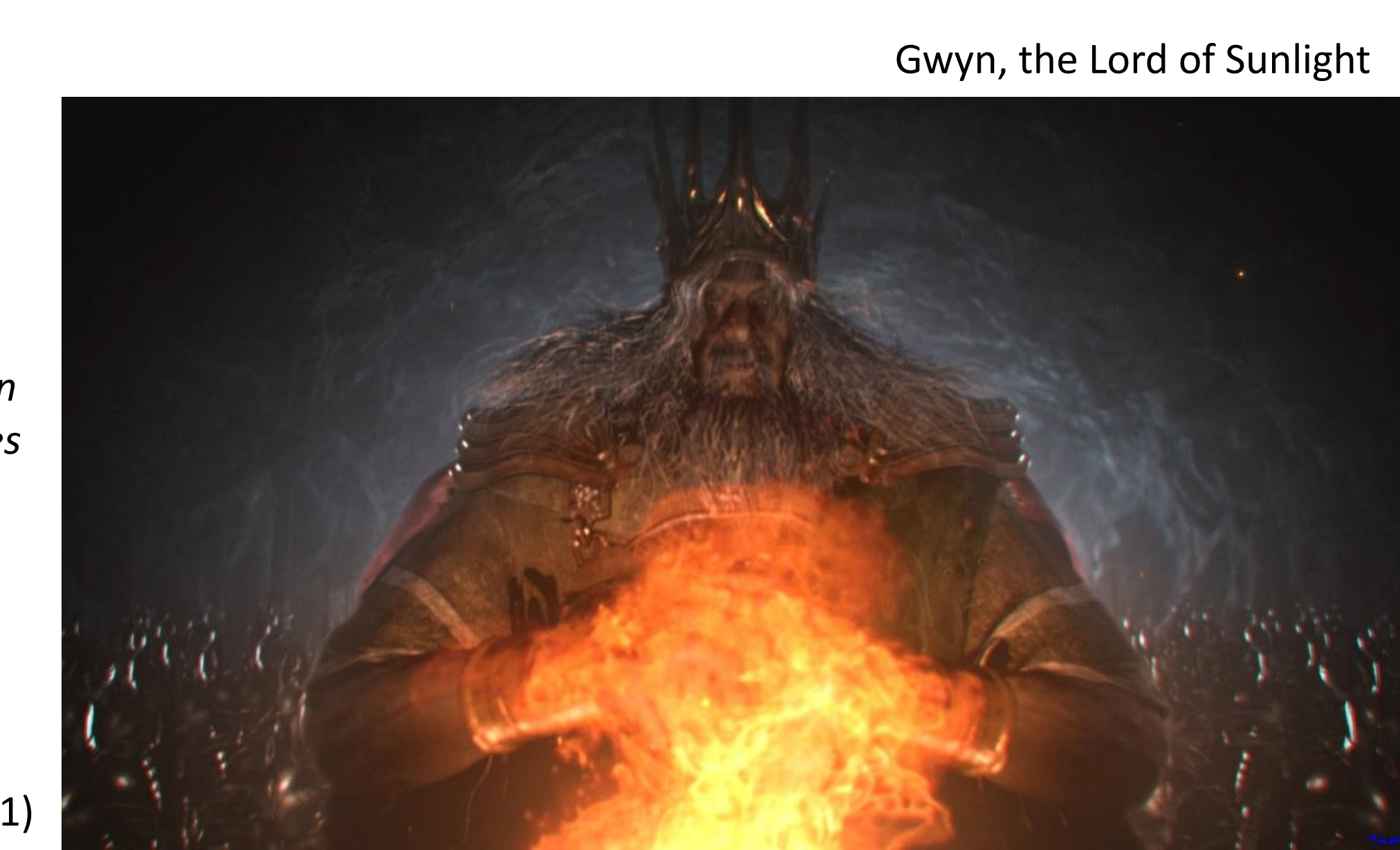
Gwyn, the Lord of Sunlight