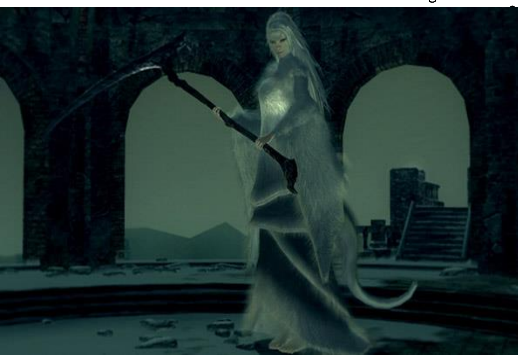
The Divine Dragon Priscilla

Dark Souls' version has Jeremiah die, as shown by his corpse that is found behind Priscilla; Jeremiah later returns as a dark spirit to take vengeance. Jeremiah is still seen with the bloody bag partially sealed on his body.