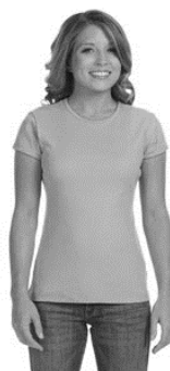
Style B (Women's)

Why purple and gold? It's a throwback to UNC's old colors! Before we used navy and gold, purple and gold were the official colors of the university. When the football jerseys washed out to navy when laundered, the university decided to officially switch from purple to navy.