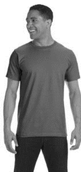
Style A (Men's)

T-Shirts are available in the following styles in 100% Organic Cotton ( Shirts only sold in purple ):