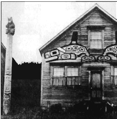
The Bear Clan totem, Angoon, Alaska, circa 1890.