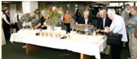
Attendees of the 2007 Michener Centennial Celebration enjoy specially prepared refreshments prior to the opening of the permanent exhibit, James A. Michener: The Man, the Writer, the Legacy .