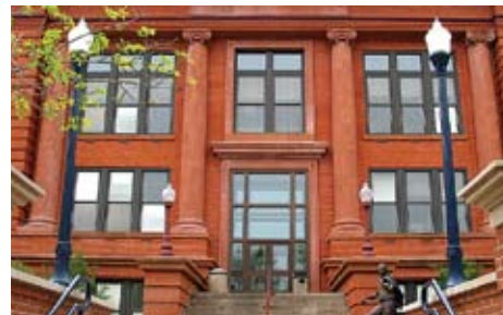
Kepner Hall, home of the Monfort College of Business

During fall 2007, the Monfort College of Business received over $260,000 in donor gifts to support scholarships, classrooms, and programming. Donors include Colorado accounting firm EKS&H, the Monfort Family Foundation, and State Farm Insurance.