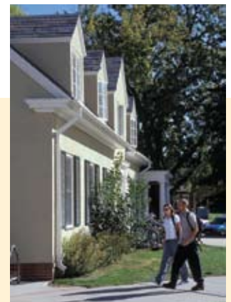
Central Campus Residence Halls