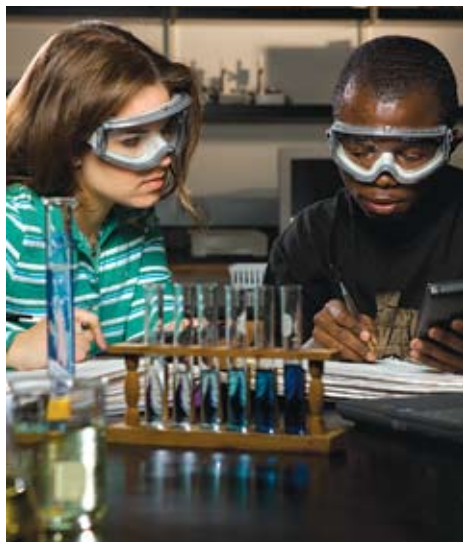
UNC Students at Ross Hall