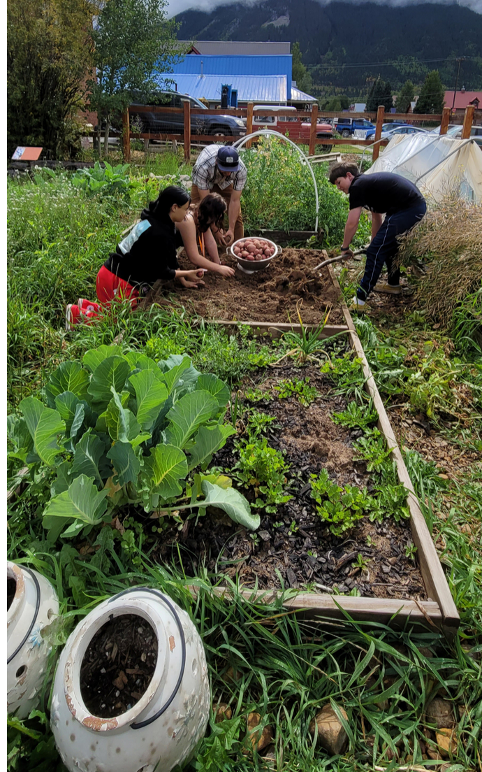
Students dig potatoes in the community garden at Silverton School.

The first members of the SWCEC were five school districts (Silverton, Bayfield, Durango, Pagosa Springs, and Ignacio), plus Pueblo Community College and Fort Lewis College . By all accounts, the first two years of the organization's existence have been a success. It has brought more than $8 million to the southwest region of Colorado for the purpose of building shared systems for rural school districts. Four additional districts (Montezuma-Cortez, Dolores, Dove Creek, and Mancos) plan to become members of SWCEC in the future.