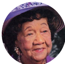
Dorothy Height (1912-2010)