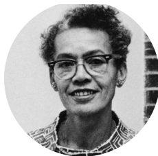
Pauli Murray (1910-1985)

National Martin Luther King Jr. Day is observed the third Monday in January. This year, we were challenged to reflect on the mentors and support figures that influenced Martin Luther King Jr. and worked alongside him to achieve some of the successes for the civil rights movement. Here are some less visible figures who made strides in the long-standing journey to change: