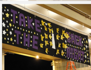
Take Back the Night September 27