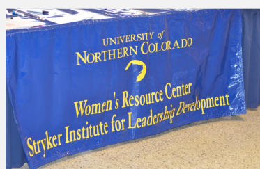
Women's Conference November 14