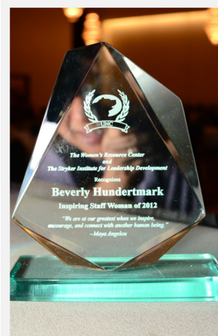
The Inspiring Women's Award

Women's Recognition Reception and Inspiring Women's Award: Recognizing the extraordinary contributions of outstanding women on campus