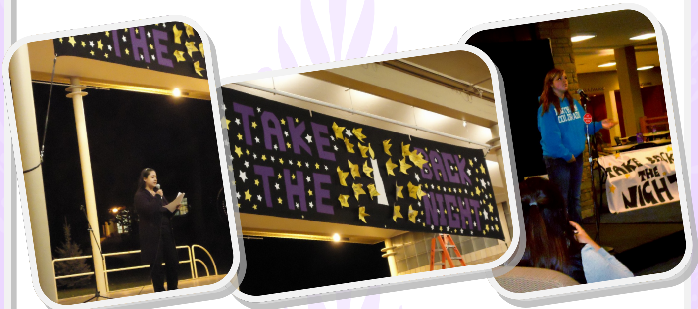
From left to right. 1) A student speaks at the Take Back the Night Rally 2011. 2) The Tack Back the Night Banner 3) A Student speaks at the Take Back the Night Open Mic 2011.

Event goers will also participate in a candlelit march, followed by an Open Mic at the Fireside Lounge in the UC. Please Join us on Thursday Sept. 27th at 6:30pm.