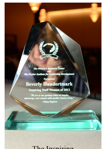
The Inspiring Women's Award

Women's Recognition Reception and Inspiring Women's Award: Recognizing the extraordinary contributions of outstanding women on campus