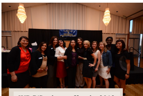
WRC/Stryker staff at the 2012 WRR