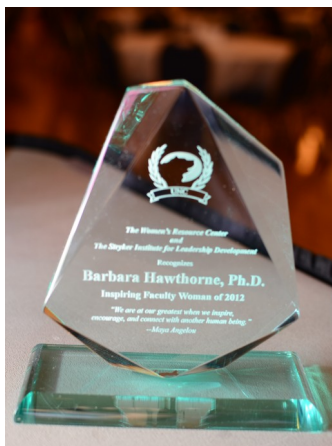
2012 IWA AWARD

"ALWAYS KNOW AND VALUE THE DIFFERENCE YOU MAKE IN THE WORLD" ~UNKNOWN