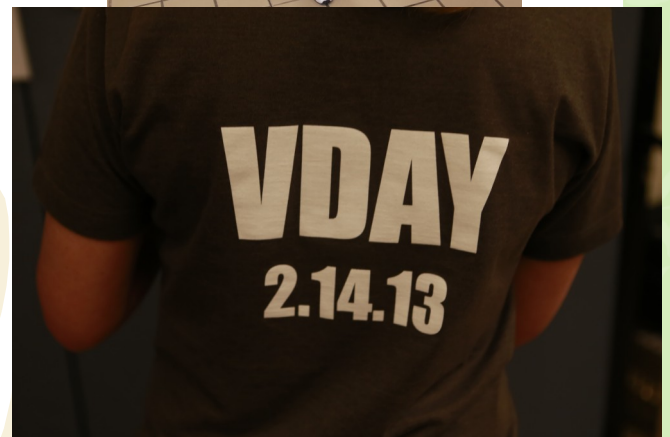
Images: UNC students, staff, and the Greeley community participate in V-Day

The WRC/SI are now taking nominations for the 2013 Inspiring Women's Award. Each year a student, faculty, and staff member of UNC receives the award in recognition for their inspiring work at the Women's Recognition Reception in April. For more information you can visit the WRC website at www.unco.edu/wrc .