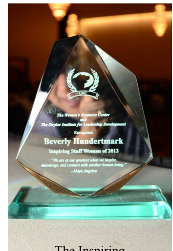
The Inspiring Women's Award

Women's Recognition Reception and Inspiring Women's Award: Recognizing the extraordinary contributions of outstanding women on campus