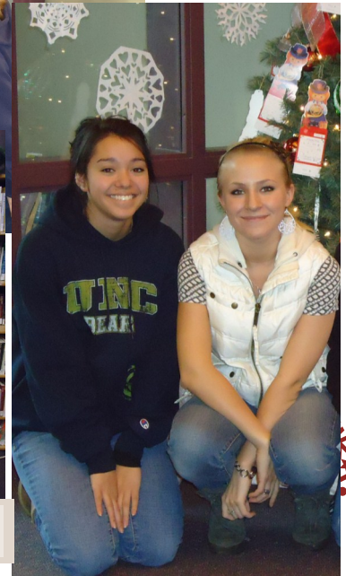
WRC/SI Staff and Giving Tree