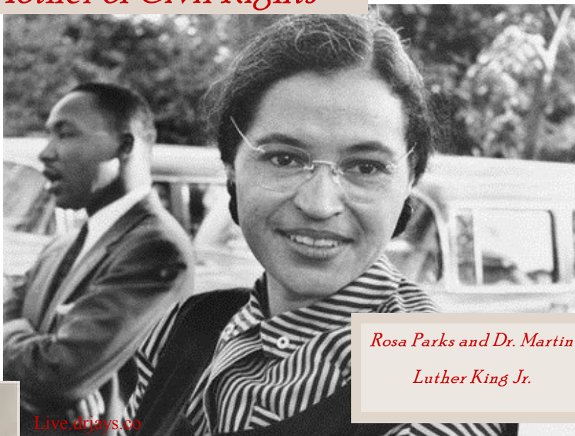
Rosa Parks and Dr. Martin Luther King Jr.