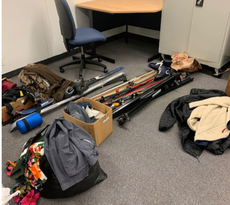
A sampling of the gear available at the Giveaway