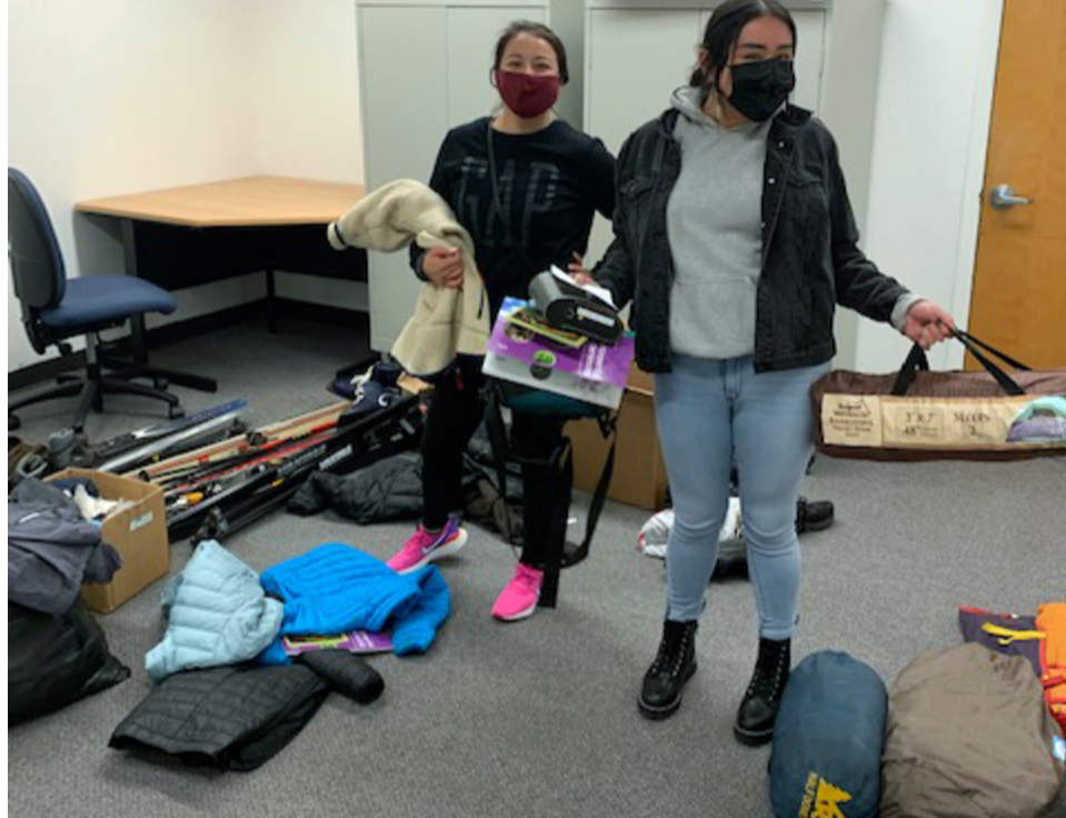
CUE teacher candidates "shopping" for gear