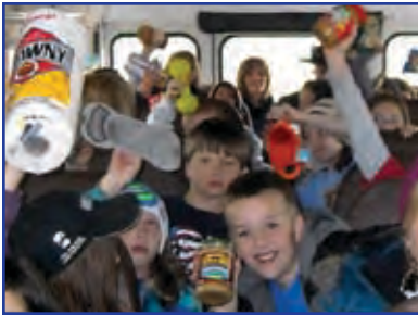
Kids earning enough money to make a class trip to Animal House to give us wish list donations.