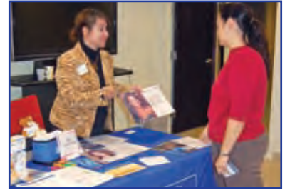
A representative from Juvenile Diabetes Research Foundation visits with a state employee at the CDLE/DPA fair.