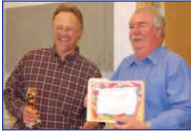
While attending a CDOT CCC event, an employee is recognized for his efforts.