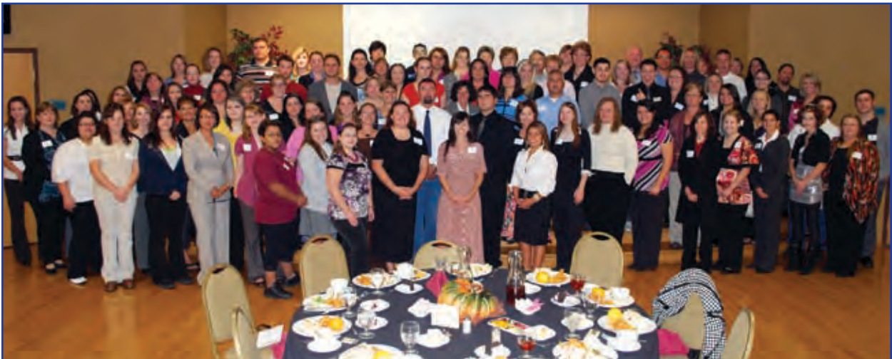
Gifts from Colorado Combined Campaign helped to financially assist more than 125 individual students with their tuition, books and fees during our 2010 – 2011 academic year.