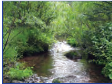
Lush and green with water restored by the Colorado Water Trust's Instream Flow Program.