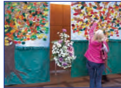
Colorado Organization for Victim Assistance's Remembrance Tree: Each leaf represents someone who has been affected by crime.