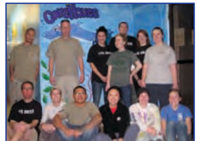
United Way of Weld County volunteers painted a mural on the wall on MLK Day for c.a.r.e.