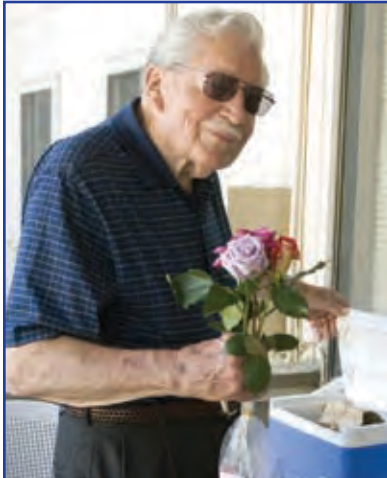
A Meals on Wheels of Boulder volunteer helps in his community.