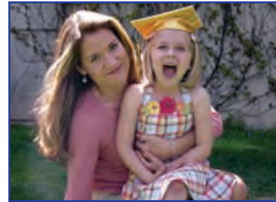
Support for Project Self-Sufficiency of Loveland – Fort Collins is an investment of the future of single parent families.