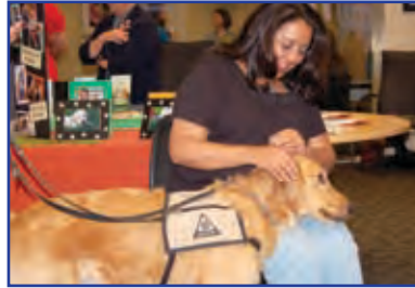
Hudson, a pooch from Canine Partners of the Rockies , cuddles at an agency fair.