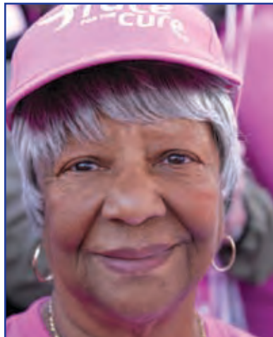
Funding life-saving research and community health programs, Susan G. Komen for the Cure's three Colorado affiliates are racing to find a cure for breast cancer.