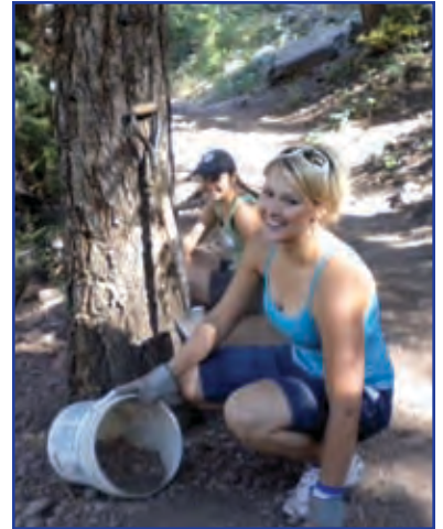
Colorado Mountain Club volunteers maintain hiking trails at Eldorado Canyon State Park.