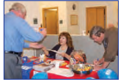
Transportation employees sign up to support CCC at their annual chili cook-off.