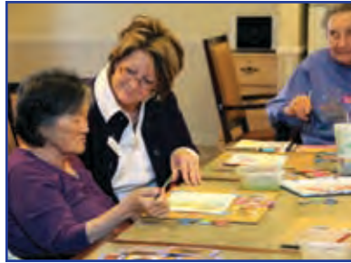
Patient and family support is offered to those affected by Alzheimer's disease, as well as vital community education programs, by the Alzheimer's Association, Colorado Chapter .