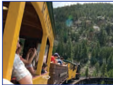
History Colorado provides experiences that truly connect you to history, like riding a steam train across a 100-foot-high bridge on the historic Georgetown Loop Railroad®.