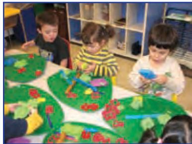
Busy Bees sensory activities for 3-year-olds at United Day Care Center .