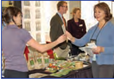
Every year CCC nonprofit partners share their message and work with state employees.