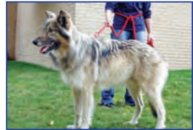
Rajan, a visitor from the W.O.L.F. Sanctuary was an educational and welcome addition to Colorado School of Mines CCC events.