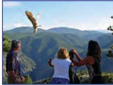
Great Horned Owl from the Rocky Mountain Raptor Program flies free again over the Rocky Mountains.