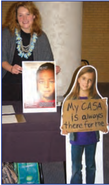
CASA attends an agency fair to speak to state employees about their work.