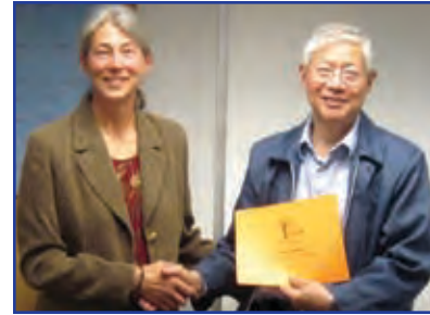
Education & Life Training Center end-of-term student recognition celebration.