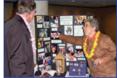
An Earthlinks representative talks about their Greenfingers Project with state employees.