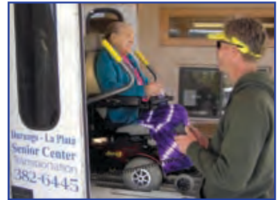
San Juan Basin Area Agency on Aging's Senior Services Program gives a lift in La Plata County, through United Way of Southwest Colorado .