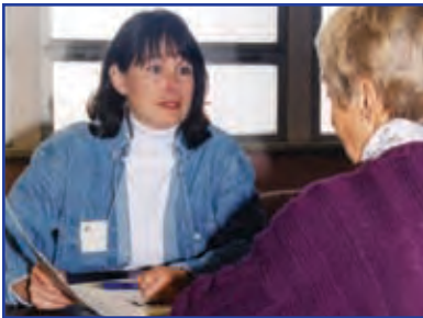
Incarcerated women find new hope for successful re-entry through Center for Spirituality at Work's Making Choices mentoring.