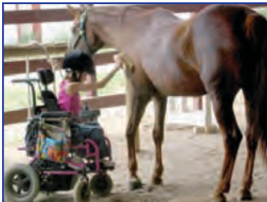
Yee-haw! At Colorado Therapeutic Riding Center's All-Abilities Summer Camp we discover that a disability is only a difference and that everyone, regardless of ability, faces challenges in life.