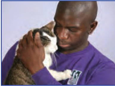
Helpless, homeless pets by the thousands are lovingly cared for at the Denver Dumb Friends League .