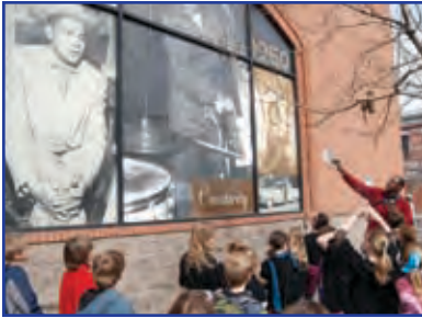
History Colorado's walking tours help our youth learn about the people, places and stories that shaped Colorado.