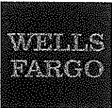
(Red box with shading)