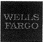
(Red box with gold letters)