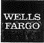
(Black box with white letters)